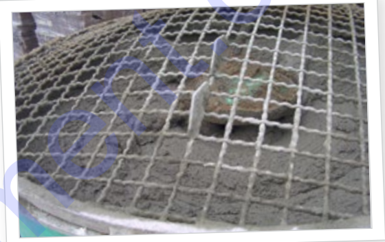
Way, way overloaded...but still running strong! Do not try this at home.