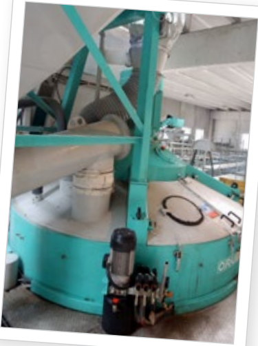
Whose your Mamma?.. This great big mixer gave birth to the 360 and 750 .

The Mortarman 360 and 750 are towable mixers with the know how and guts of a batch plant!