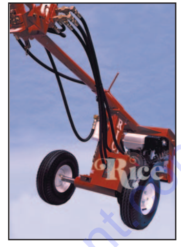
Self Propelled Model Forward & Reverse Drive

RICE Hydro is proud to offer superior products for the Contractor, Rental and Agricultural Industries. The DIRT DAWG is available in a Standard, Self-Propelled or Torque model. Simple one-man operation, coupled with the power of the torque-free hydraulic system and neutralized weight balance, make the DIRT DAWG an awesome digging machine. Easy to maneuver from hole to