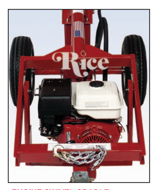
ENGINE SWIVEL CRADLE

Structurally designed for decreased vibration.