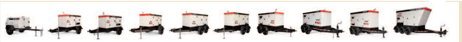
Terex® generators meet your power demands through a wide range of models.

A range of Terex® Super Quiet and Gen-Pac generators offer power capacities from 20kW to 288kW. Features include enough capacity to carry 24 hours of fuel on board, environmental spill containment, a heavy-duty trailer and consistent, accurate voltage regulation.