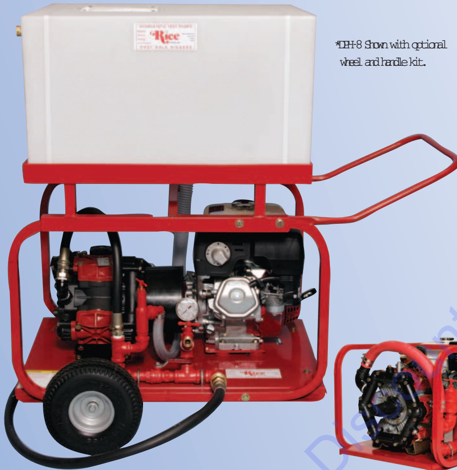
*DPH-8 Shown with optional wheel and handle kit.

The DP Series hydrostatic test pumps are large volume, medium pressure units, with flow rates up to 56 GPM and pressures up to 600 PSI. Designed to quickly fill and test lines up to 96" in diameter. Unique to the diaphragm pumps are their ability to handle up to a 10% chlorine solution, and can be run dry without damage to the pump.