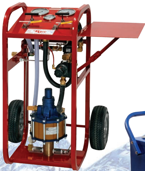
HP-10V 10,000 PSI

stainless steel liquid filled, ensures less flutter, with accurate readings