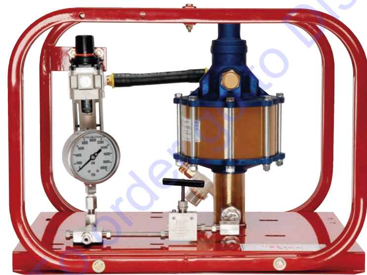
HP-20 • 20,000 PSI