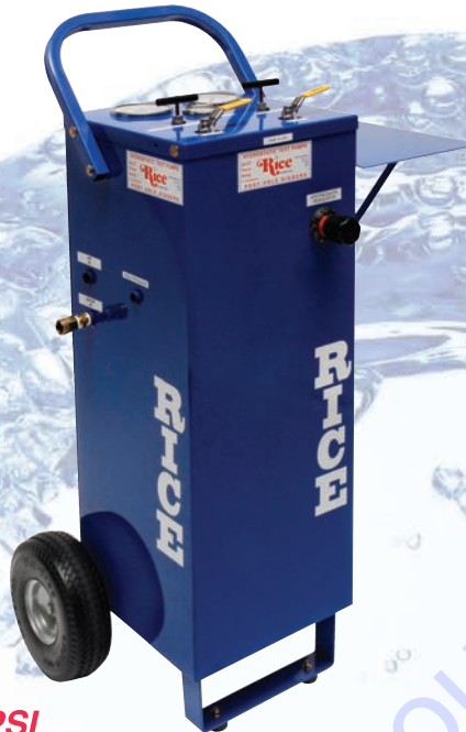
HP-10B 10,000 PSI