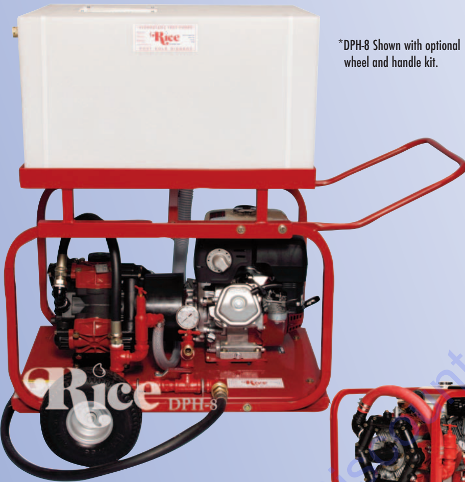
*DPH-8 Shown with optional wheel and handle kit.

The DP Series hydrostatic test pumps are large volume, medium pressure units, with flow rates up to 56 GPM and pressures up to 600 PSI. Designed to quickly fill and test lines up to 96" in diameter. Unique to the diaphragm pumps are their ability to handle up to a 10% chlorine solution, and can be run dry without damage to the pump.