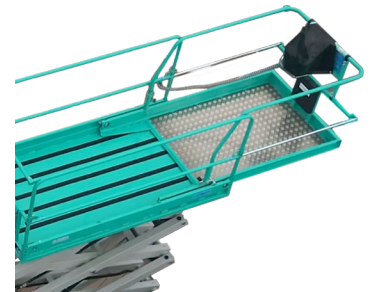
Manual deck extension of 59" 1100 lb Capacity (Stabilized) Number of Occupants - 4