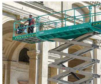
Driveable at full height and fully extended