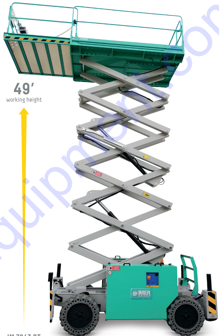
IM 7043 RT