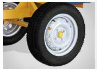
Heavy duty 2" wheels axle, with high speed hubs and wheels.