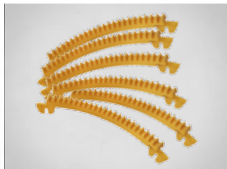
Segmented ring gear in 6 pieces.