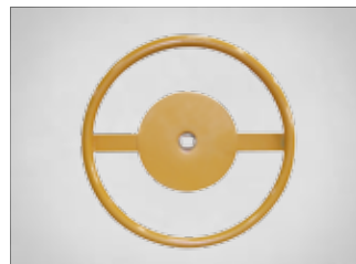
Steering wheel with strength reduction system.