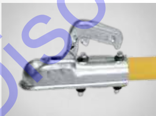
High speed Towable