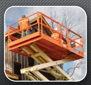
More Capacity Maximum 2,250 lb

Meet uneven surfaces head-on with the push of a button. You get precise selfleveling when positioned on up to a fivedegree angle from side to side and up to a four-degree angle from front to rear.