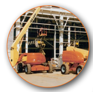
WORK IN CROWDED AREAS

A standard oscillating axle and optional four-wheel drive give you outstanding drive performance on rough terrain. Optional four-wheel steer with three-position switch provides unmatched agility in tight spaces. Improved platform controls have been redesigned for smoother, controlled operation and job site productivity.