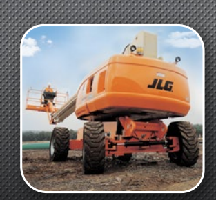
Solid Ground 45% gradeability and oscillating axle for improved traction.