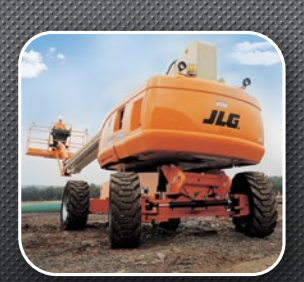
Solid Ground 45% gradeability and oscillating axle for improved traction.