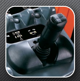
Drive Control Ease of drive

operation joystick with integrated thumb steer.