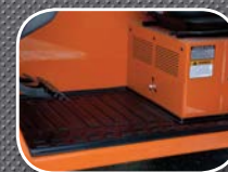
Molded Floor Mat*