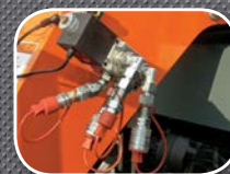
2nd Auxiliary Hydraulics*