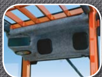
Radio Ready Kit*