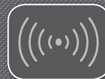
Reverse Sensing System*