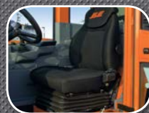
Air Ride Seat*