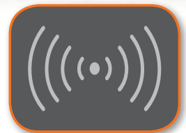
Reverse Sensing System