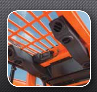
Optional Air Conditioning Stay cool on hot days and work in air conditioned comfort.