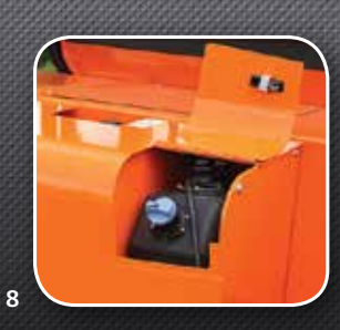
Easy Access Components are easily accessible for service and maintenance.