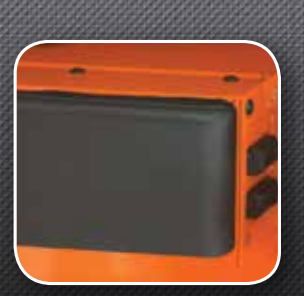
Integrated Arm Rest

Reduces operator fatigue and allows for finite joystick movements when required.