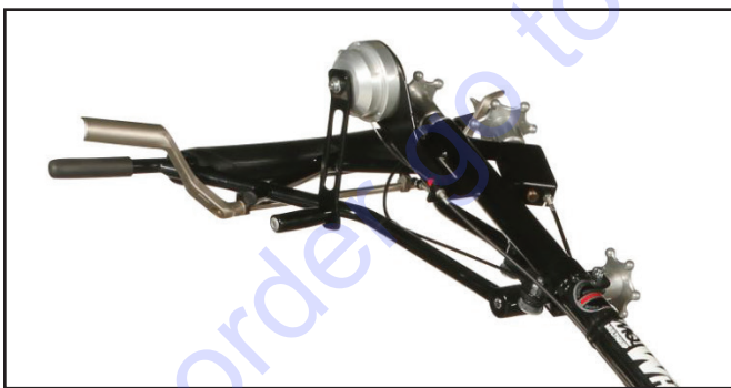
Height adjustable handle and location of all controls ensure operator comfort.