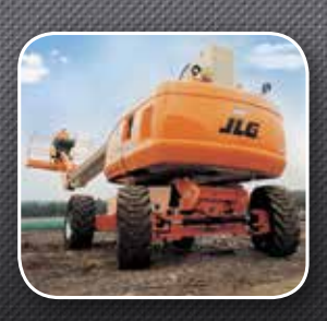
Solid Ground 45% gradeability and

45% gradeability and oscillating axle for improved traction.