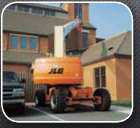
Narrow Width Narrow fixed-width frame allows for faster setup.